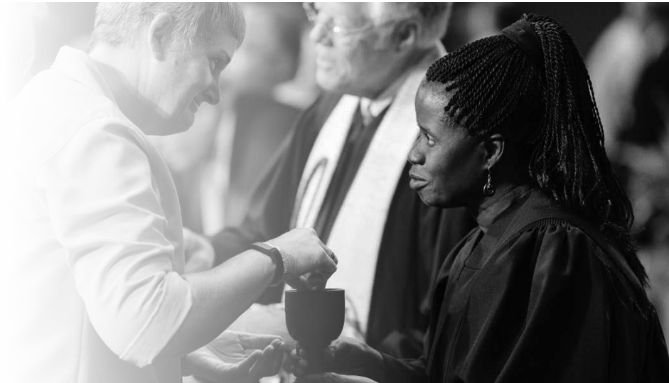
"Christ is present here, and Christ's presence really changes us." Read more on page 2.