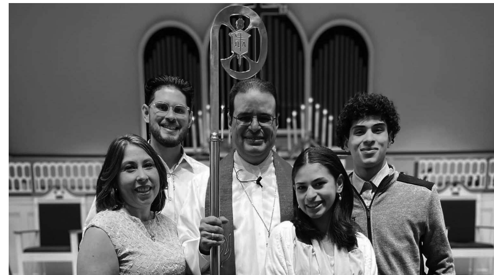
"I see congregations moving away from a spirit of competition to a spirit of collaboration so we can amplify our impact on communities!"